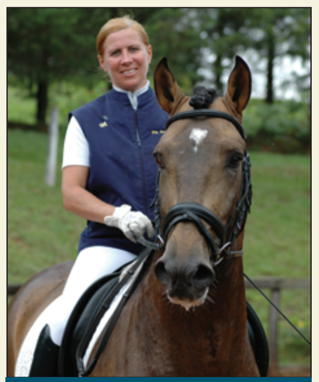
Alfacinha Interagro hopes to follow in his talented father's footsteps

The pair was ready to set the world alight and were due to represent Brazil at the Pan-American Games before an acute case of bacterial colitis struck down the grey stallion ten days before the contest. Nirvana made a miraculous recovery thanks to the on-hand veterinary care at Interagro's headquarters only to suffer acute laminitis as a