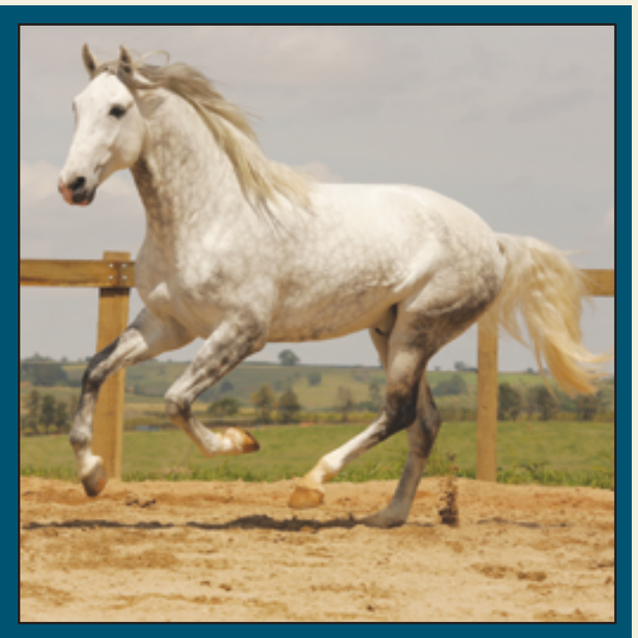
Amintas Interagro – a star of the forthcoming 2009 Lusitano Collection