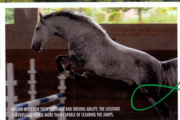
KNOWN MORE FOR THEIR DRESSAGE AND DRIVING ABILITY, THE LUSITANO IS A VERSATILE HORSE MORE THAN CAPABLE OF CLEARING THE JUMPS.

A very interesting characteristic of the Lusitano horse is that they are characterized by their mild temperament and it is strongly believed that their essential quality of being able to connect with human beings play a major role in qualifying the Lusitano horse as one of the best riding horses ever.