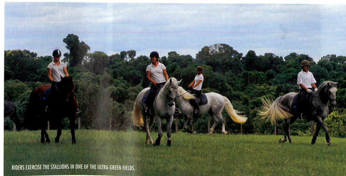
RIDERS EXERCISE THE STALLIONS IN ONE OF THE ULTRA-GREEN FIELDS.

Our last day at Interagro was an experience that I can best describe as a visit to "Equine Disneyland." Cecelia and Antonio took us to the sister farm, a few miles away through sugar cane fields to see the herds of two and three-old-stallions. These affectionate horses surrounded us and sniffed and nuzzled their way into our hearts. There really is something very magical about being in the midst of around 80 horses running free in a vast sea of grass.