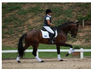
Corsário Interagro being trained under saddle at Interagro Farms.