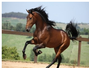
Corsário Interagro at Interagro Farms in Brazil.